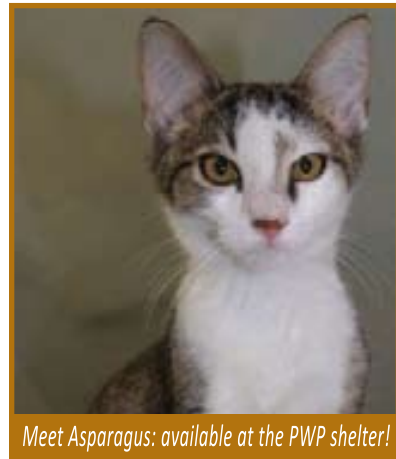
Meet Asparagus: available at the PWP shelter!